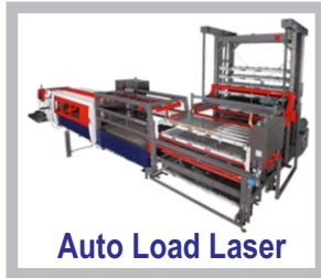
Auto Load Laser