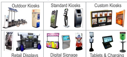
Outdoor Kiosks Standard Kiosks Custom Kiosks Retail Displays Digital Signage Tablets & Charging