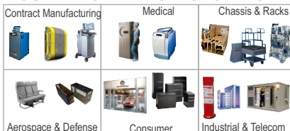
Contract Manufacturing Medical Chassis & Racks Aerospace & Defense Consumer Industrial & Telecom