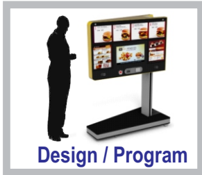
Design / Program

Fabcon has been a leading design, fabricating and manufacturing company since 1977, and has earned a stellar reputation for ISO 9001 certified quality and support. Our three divisions, Precision, Creative and Systems allow us to serve start-ups to Fortune 500 companies across numerous industries.