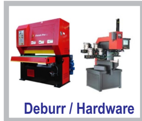
Deburr / Hardware