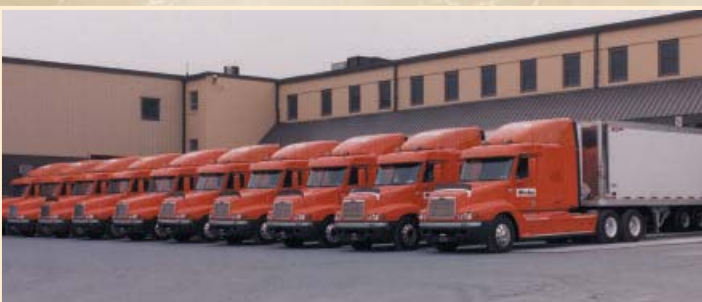
Large truck fleet connects our extensive distribution network

East Penn's large, modern truck, trailer and van fleet is on the road continually, keeping distributor and retailer stocks available when and where merchandise is needed. Our fully equipped maintenance garage keeps the fleet rolling around the clock.