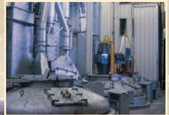
Furnace and Smelter

Our lead smelter and refinery is a model for the industry recycling virtually 100% of every used lead-acid battery component brought to our facility. East Penn built the battery industry's first acid reclamation plant, avoiding potentially hazardous acid disposal.