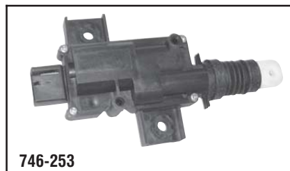
746-253 Chrysler 2003-96 Minivans, Sliding Door