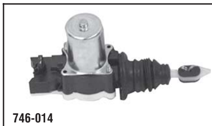
746-014 GM 2005-77 Various Models, Left or Right.