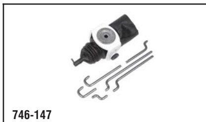
746-147 Ford 1994-80 Various Models, Left and Right Side