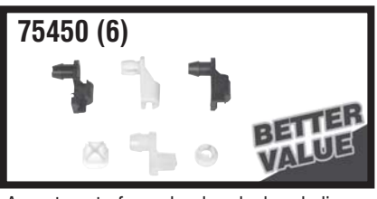
75450 (6) Assortment of popular door lock rod clips. Covers GM 2004-59, Ford 2000-80, Chrysler 2000-71. Applications include both cars and trucks. Kit contains 75451, 75452, 75453, 75454, 75455, 75459 and 75460.