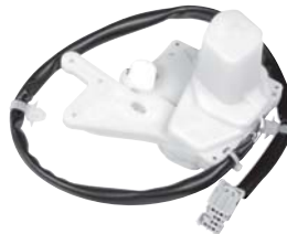
746-360 Fits Honda Accord 1997-94