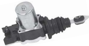
746-014 Fits 90% of GM Models 2005-77

The door lock actuator is the mechanism used to lock or unlock the vehicle's power door locks.