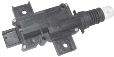
746-253 Fits All Chrysler Minivan Sliding Doors 2003-96