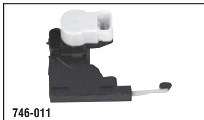
746-011 GM 2006-91 Various Models, Right Side.