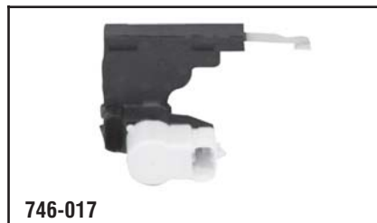
746-017 GM 2006-91 Various Models, Left Side