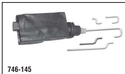
746-145 Ford 1994-80 Ford/Lincoln/Mercury Various Models, Left and Right Sides.