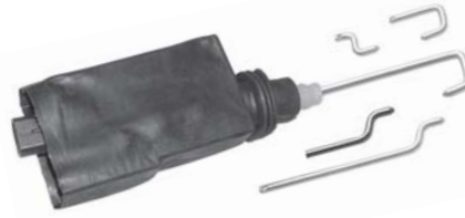
746-145 Fits 95% of Ford Models 1994-80