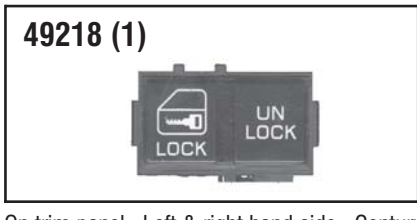
49218 (1) On trim panel. Left & right hand side. Century 1989-85, Skyhawk 1989-83, Cimarron 1988-83, Camaro 1989-82, Cavalier 1990-83, Celebrity 1989-85, Citation 1985, Corvette 1985-84, Cutlass 1995-91, Firenza 1988-82.