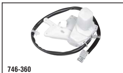
746-360 Honda 1997-94 Accord.