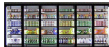
EISA (Energy Independence and Security Act) compliant