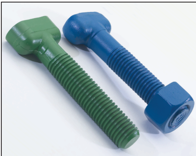
Xylan offers fasteners such as T-Bolts controlled torque, corrosion resistance and color-coding.

Xylan coatings solve as many problems for the oil industry as they do for waterworks.