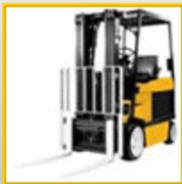
Class I Electric Rider