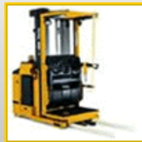
Class II Narrow Aisle