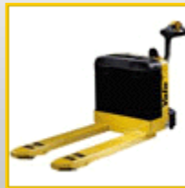
Class III Motorized Hand