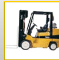
Class IV Cushion Tire