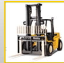
Class VI Pneumatic Tire