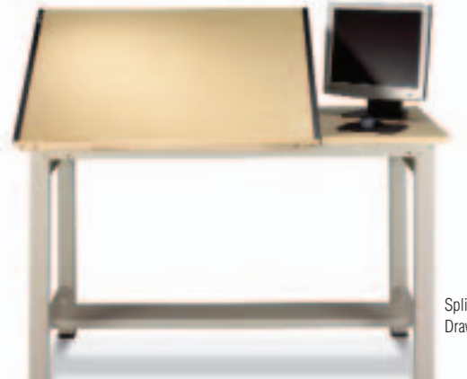
Split Top Drawing Tables

These tables are ideal for a variety of end users ranging from students and architects to electricians and engineers. This Split Top drawing table is available in two widths, including an 18" wide fixed surface perfect for computers, personal laptops or additional lighting. Split Top models are offered with optional lockable tool drawer and auxiliary 2-drawer units.