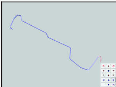
3D Part Visualization