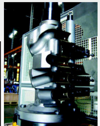
Multiple Level Bending