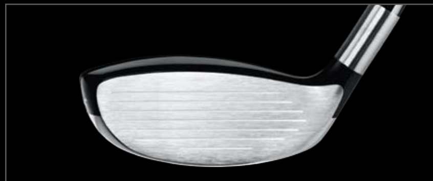
MODERN CHASSIS WITH A LONGER FACE FOR GREATER CONFIDENCE