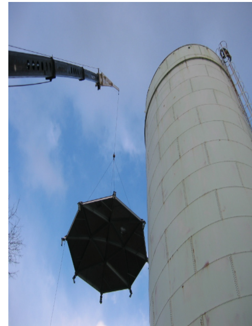
New roof installation on Brown's Mountain Standpipe