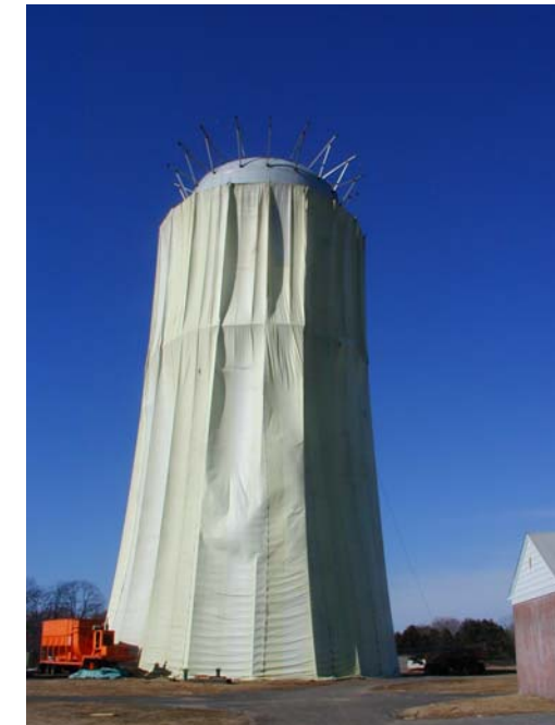
Full containment lead removal tank Jayne Blvd. tank rehabilitation project.

We can provide you with prudent answers to all of your tank maintenance and management questions based on reliable industry technologies and practices.