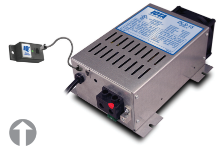
An example of an IOTA DLS charger utilizing an external IQ4 smart charge controller option.